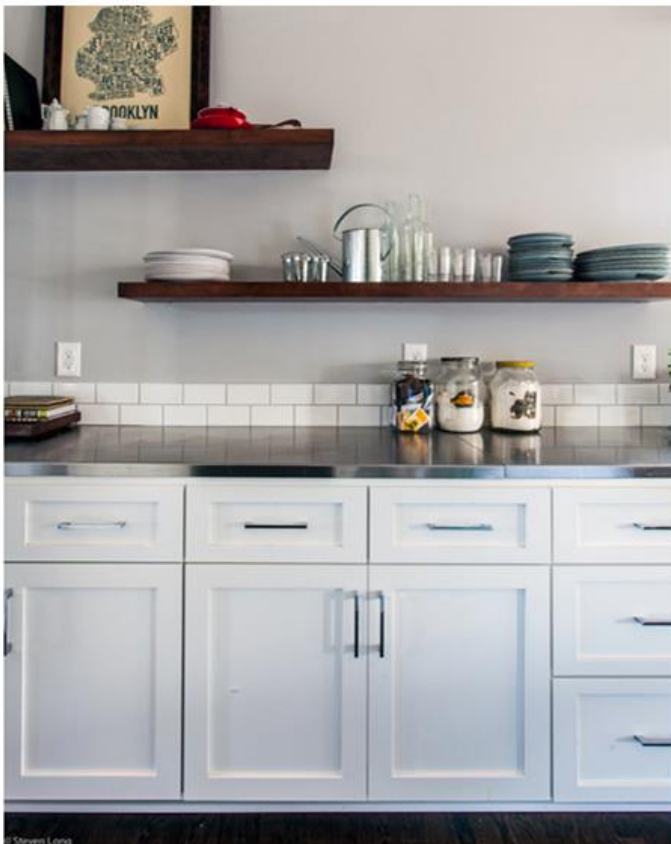
Contemporary cabinetry and hardware align beautifully with the modern, rustic shelves.

The color palette is also vital in expressing the concept of comfortable modernity. The tones of the cabinets and woods are cool, but not stark. Marcelle chose whites, grays and blues that complement the orange and chestnut hues of the wood and brick, making each surface really come to life. Without a doubt, every element of this interior was carefully considered. From the arrangement of each stool to the specificity of each material, this design reflects the undeniable beauty of a finely curated space that is, more importantly, practical.