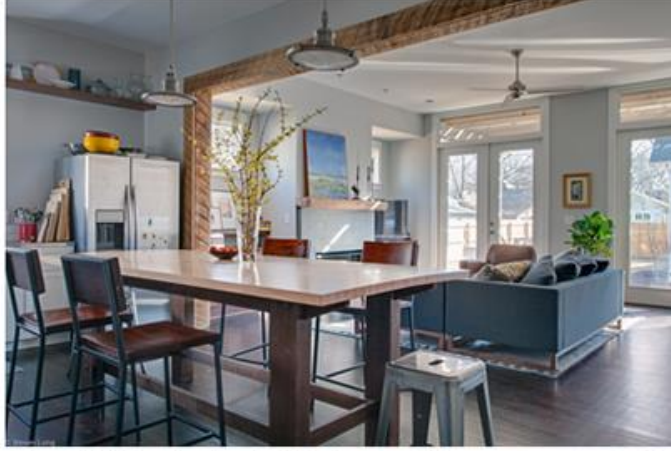
The versatile island can be used as a breakfast table, a dinner table, a preparation surface and a place to entertain guests. Marcelle stresses the importance of integrating items that are multidimensional in their functionality.

The wood that frames the doorway into the living room is echoed on the mantel above the concrete fireplace. In many ways, the fireplace articulates the entirety of the design; a perfect juncture between natural and industrial materials; a harmonious balance between hard and soft, textured and smooth, warm and cool finishes.