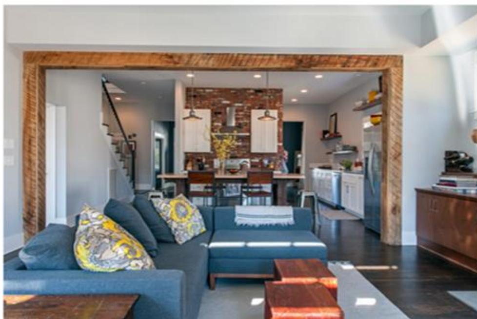
There is little separation between the kitchen and den, encouraging both spaces to be used interchangeably for living, dining and entertaining.