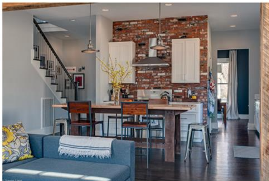
Designed by Marcelle Guilbeau , this contemporary kitchen in East Nashville blends modern and rustic materials poetically.

Lending warmth to a modern space is no small task. But for Nashville, TN-based interior designer Marcelle Guilbeau , it's a must! In order to make a house feel alive, she insists, there has to be a balance between form and function. A home — especially a kitchen — should feel inhabited and utilized. But, most importantly, it should reflect the lifestyle of its owners. In this charming new house in historic East Nashville, Marcelle blends the pastoral charm of the client's childhood home with a modern edge. Take a look at the stunning results in this warm yet industrial kitchen.