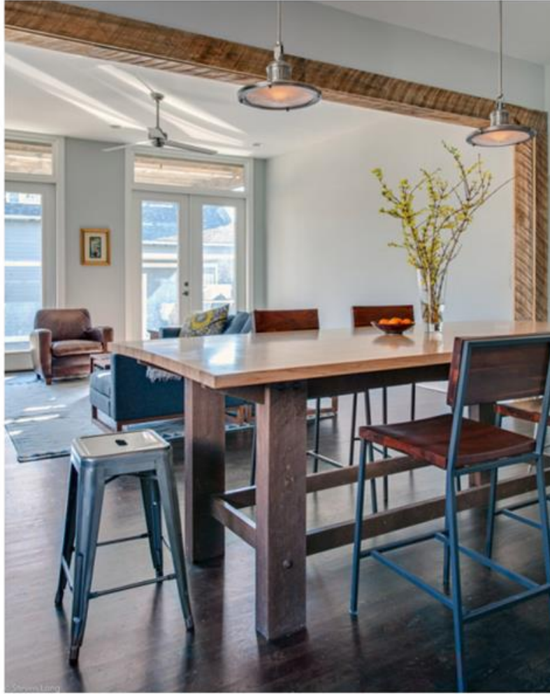
Distressed wood frames the oversized doorway between the kitchen and den. Industrial light fixtures hang above the island, creating a poignant intersection between modern and traditional elements.

This house was a new build, but the homeowners wanted to customize it to make it more suited to their personal style. Having just moved from San Diego, CA, they liked the contemporary design of buildings in that area. To bring a modern aesthetic to this home, Marcelle capitalized on clean, straight lines. She also integrated exposed brick on the backsplash of the stove and introduced stainless steel fixtures and appliances, thereby balancing the distressed finishes with a contemporary material. She even mixed different types of woods and blended neutral paint colors to create a strikingly rich composition.