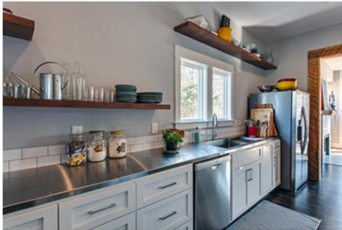
Using floating shelves, Marcelle lets rustic dishware and jars serve as ornamentation. This makes the kitchen feel like a cozy dwelling place.